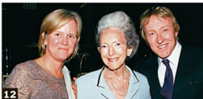
April 7: Trickle Up celebrated its 30th anniversary with a dinner at the Rainbow Room. It was attended by 336 guests.