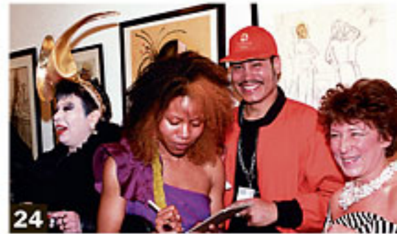
April 3: The Society of Illustrators held a reception for its exhibition "The Line of Fashion." It was a benefit to support the Gay Men's Health Crisis, a nonprofit group dedicated to the fight against AIDS. The exhibition, at 128 East 63rd Street, runs through May 2.